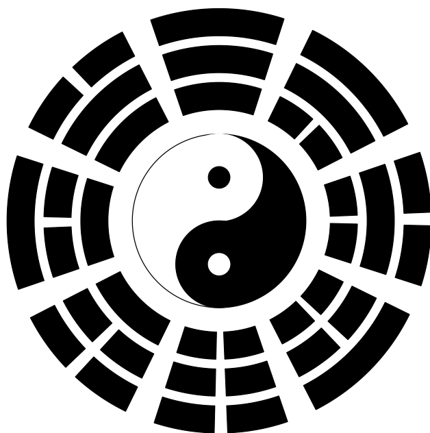
Figure 3: A Ba-gua