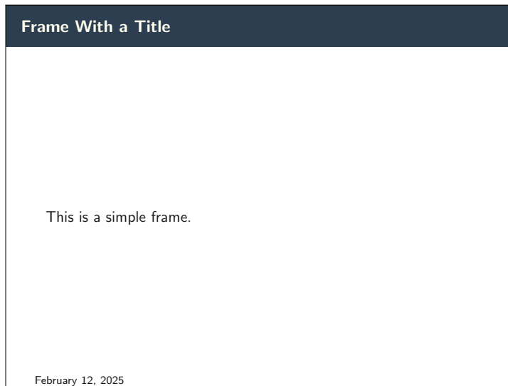
Figure 1: A simple example.

For best results, we recommend installing the fonts Fira Sans and Fira Mono and compiling with Gotham using XeLaTeX or LuaTeX. These are optional dependencies; Gotham is compatible with (e.g.) pdfL A T E X and will fall back to standard fonts if Fira Sans or Fira Mono is not installed.